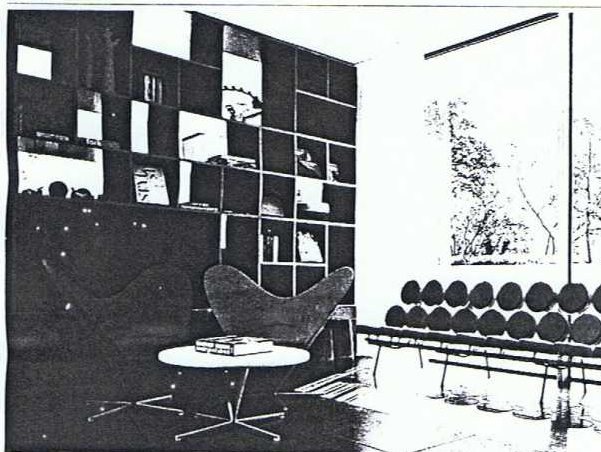
Good impression This stylish and popular hotel in Amsterdam is the city's second citizen

Cosmopolitan breaks can still be done on a budget, if you know where to look. From Paris to Brussels, we round up the best places to stay for under £50pp